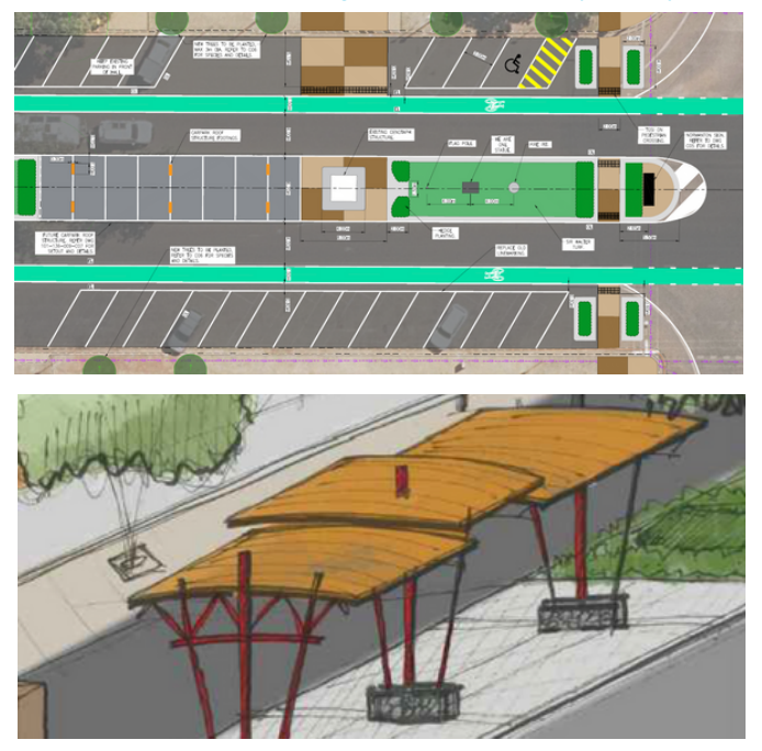
Undercover parking concept design

https://www.carpentaria.qld.gov.au/council/have-your-say