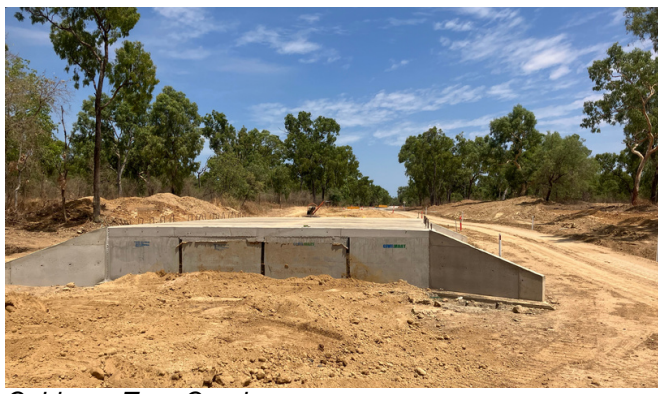
Cabbage Tree Creek

Cabbage Tree and Plane Creek nearing completion.