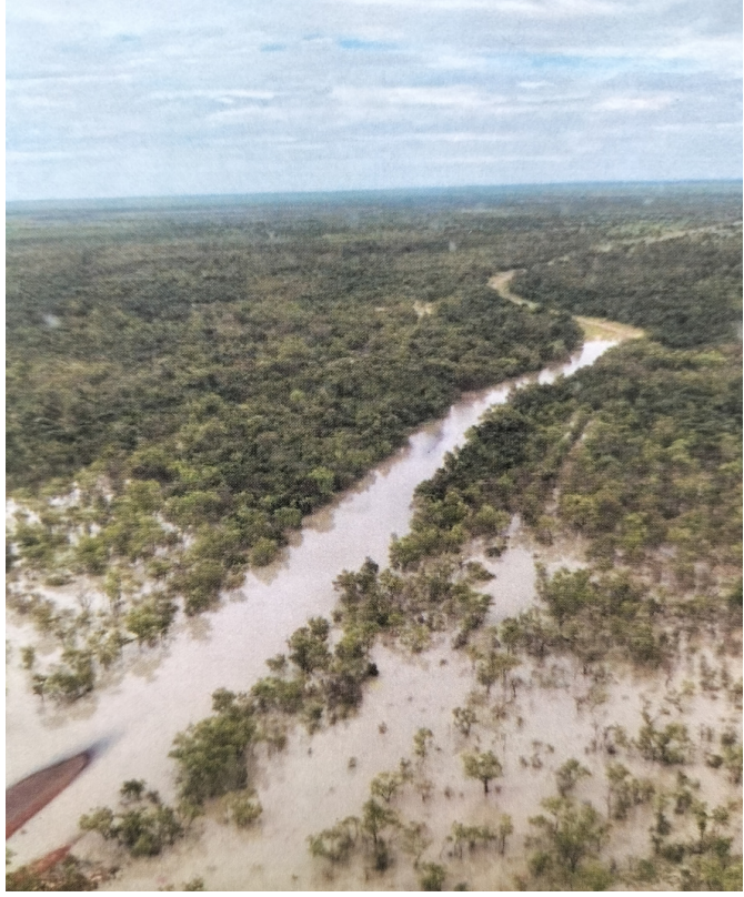
Armstrong Creek under flood - March 2023