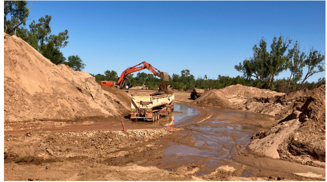
Excavations at the Leichhart River