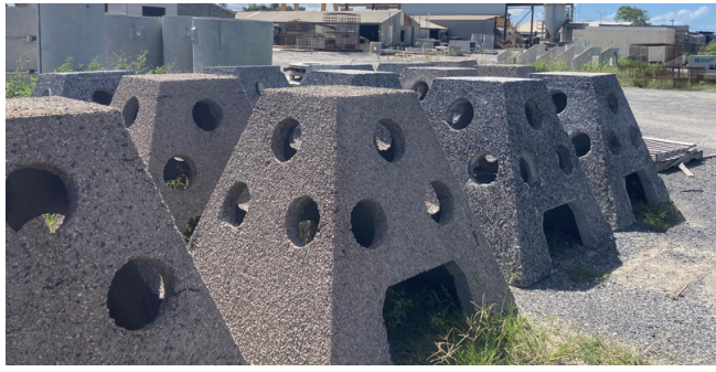
Karumba Pyramid Habitat Reef Modules