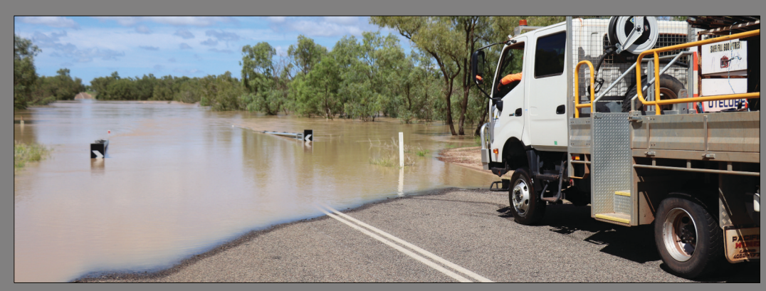
Major flooding on the Burke Development Road 89A (Cloncurry Road) at the Flinders River as flood waters peaked over the bridge at Walkers Bend.

The Queensland Reconstruction Authority administers the DRFA in Queensland, which supports communities that have been hit by natural disasters, to repair essential services and get back on their feet.