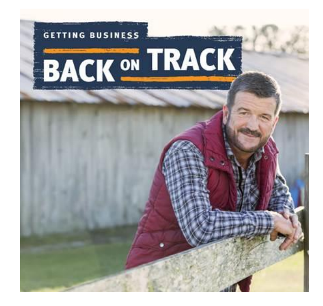
The roadshow is jointly funded by the Commonwealth and Queensland Governments under the Disaster Recovery Funding Arrangements.

If these options do not work for you please contact the department on (07) 3452 7148 to request a hard copy version of the training.