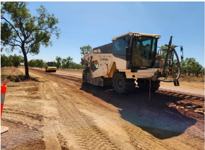
Completing the last stabilisation works on 89B