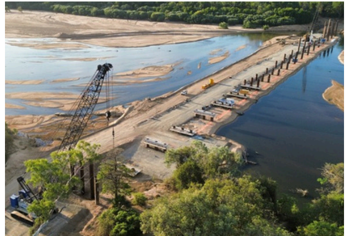
Two headstocks installed