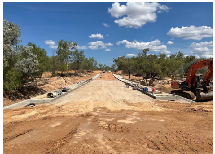
Working on the concrete batter protection