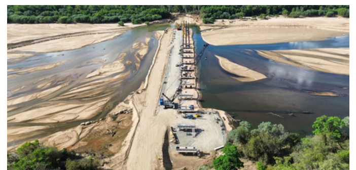
Five headstocks installed