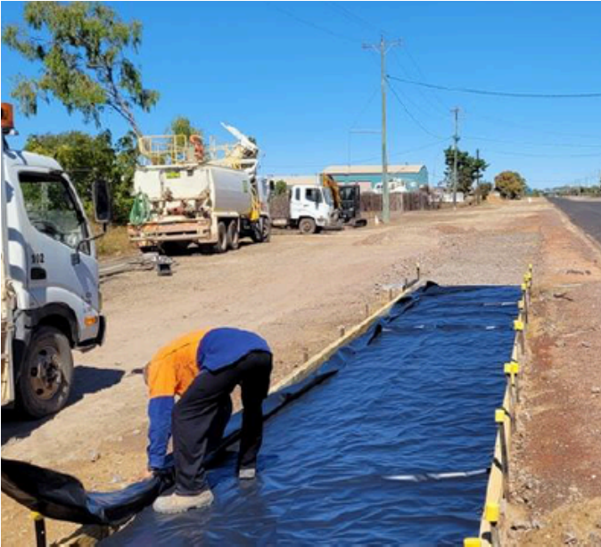
New Footpath, Yappar Street Karumba