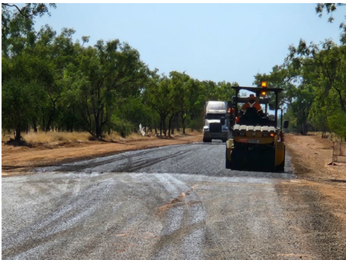
Sealing Works on 89B Betterment Package 1