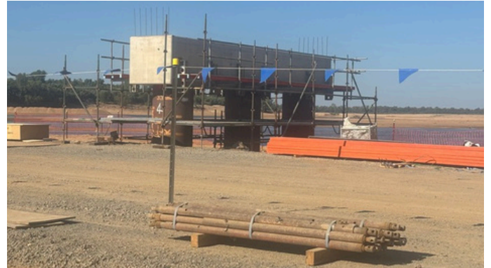
First headstock installed