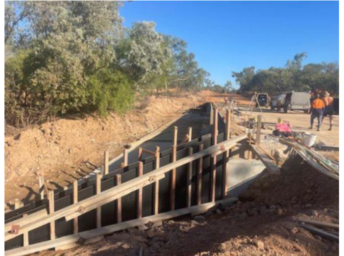
Forming up headwall and batters at Clark Creek