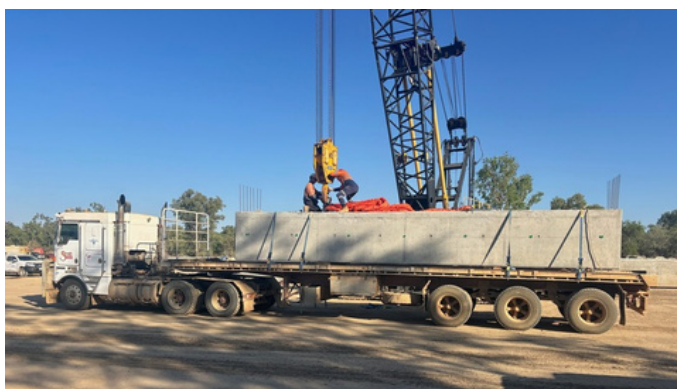
Loading the headstock to the top of the steel piles