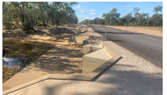
New Mentana Creek Causeway on 89B