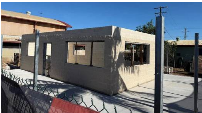
Normanton Pool Kiosk