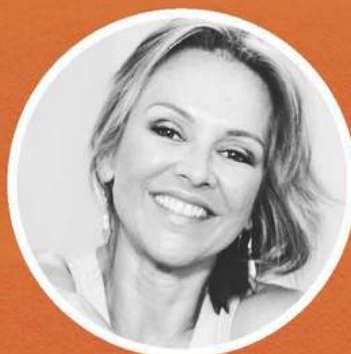
CARLA BONNER NEIGHBOURS