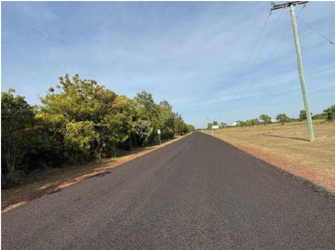
New 10mm reseal - Truck Bypass Road Karumba