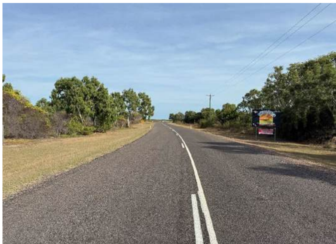
New line marking - Col Kitching Drive