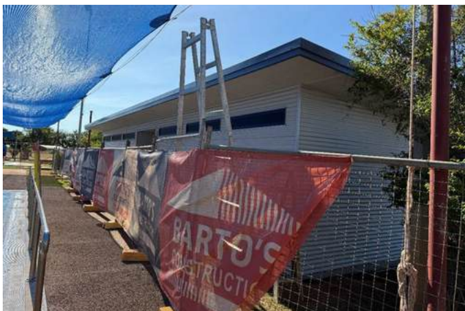
Normanton Pool Change Room