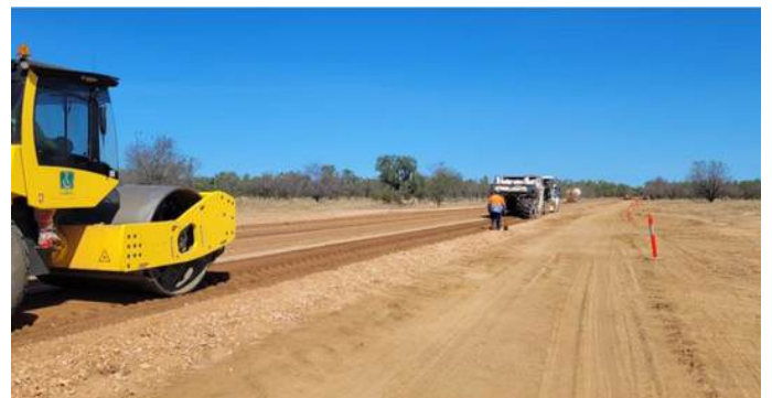
Work restarted on 89B Betterment Package 1